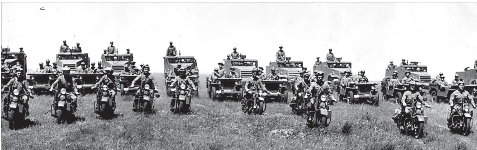
PLAIN DEALER FILE

Motorcycles, "peeps" and radio-equipped cavalry scout cars roar over the ground at 45 mph during preparations for the Army War Show at the Stadium. Motorcycles are equipped with "tommy guns," and the "peeps" are mounted with 50-caliber machine guns.