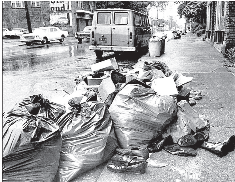
A strike left 2,800 tons of uncollected garbage on the streets.