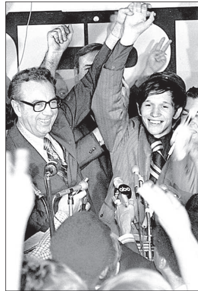
Dennis Kucinich was ostracized by the Democrats for his support of Republican Ralph Perk.