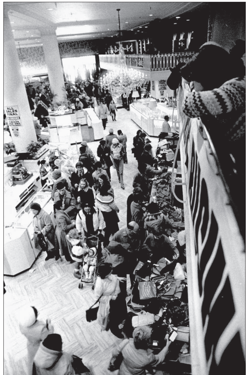
Halle's closed, but not before shoppers walked off with liquidation-sale bargains.