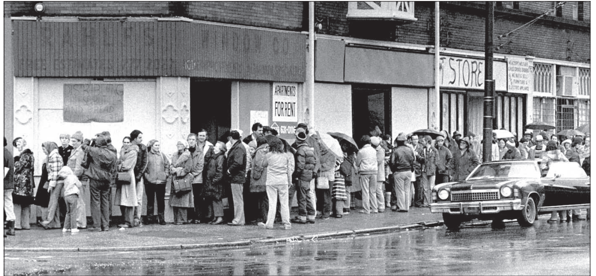
People lined up and waited 1½ hours for cheese to see them through hard times.