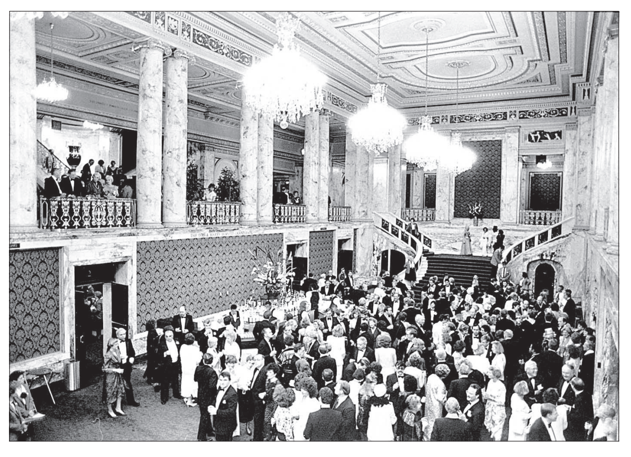
The Palace Theater showed off its restored splendor, as the revival of Playhouse Square continued.

But Kosar returned and led the team to victories in its last five games. They lost the wildcard playoff game, 28-23, when the Houston Oilers rallied in the fourth quarter.