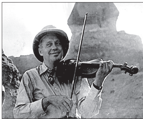
Jack Benny plays "Love in Bloom" during a USO tour in Egypt in 1943.

McGunagle is a Cleveland freelance writer.