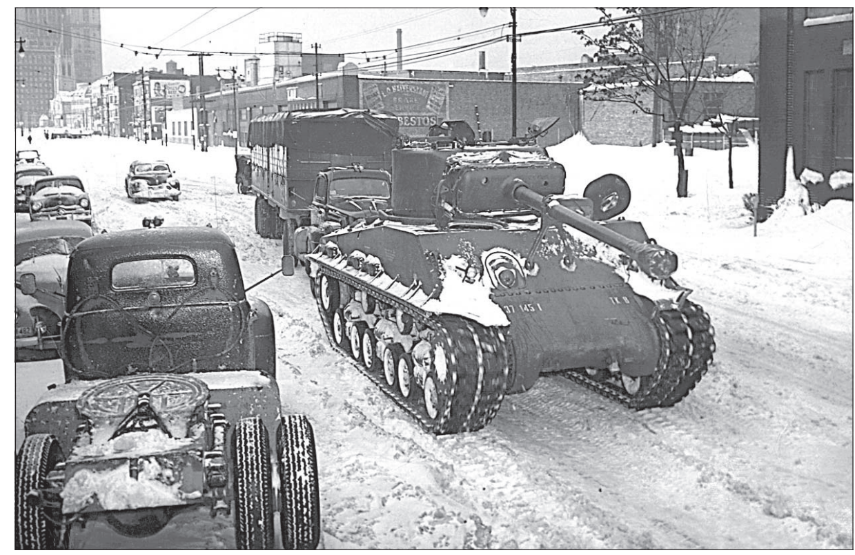
A National Guard tank tows a truck from lower Payne Ave. on Nov. 26, 1950.

Stores ran out of bread and milk. The president of the Telling-Belle Vernon Co. urged that any milk available be saved for babies and sick people. Some hardy milkmen took their trucks as far as they could on main streets and made deliveries on foot.