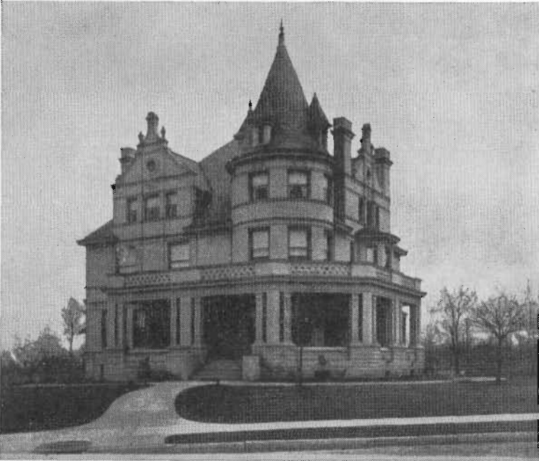
From The Cincinnati Southern Railway

2 o'clock in the morning. Here in Cincinnati I am in bed every night by 9:30.