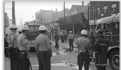
1966 Hough “riots.”