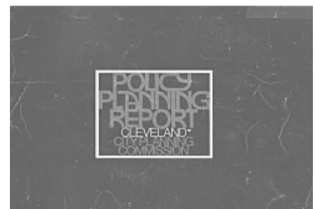
The stark black and grey cover of the Policy Planning Report (1975) was indicative of the somber realism of the plan’s contents.

The work of Krumholz’ City Planning staff culminated (but did not end) in 1975 with publication of the Policy Planning Report , a bold and ground-breaking comprehensive plan that made social policy the centerpiece of Cleveland’s city planning program. Cleveland’s plan quickly took center stage nationally and even internationally in the field of city planning, as it sparked debate over the appropriate role of the city planner in local government.