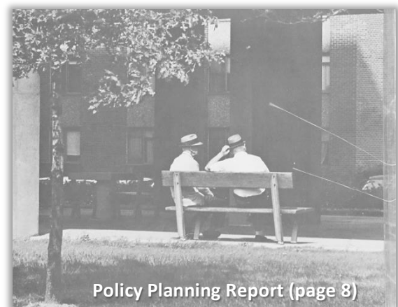
Policy Planning Report (page 8)