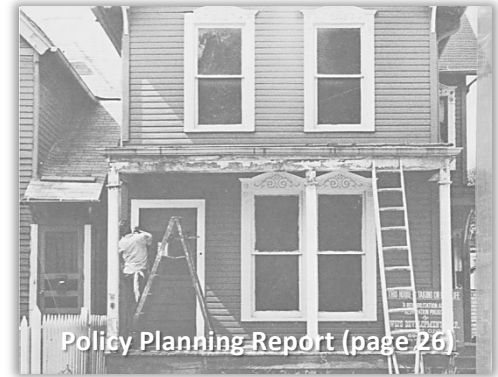
Policy Planning Report (page 26)

Housing Policies. The plan focused much of its policy development on housing , noting that the City Planning Commission's ability to affect housing outcomes was greater than was the case with many other subjects of interest to city residents, because of the Commission's credibility in the field of housing. Among the plan's housing policy recommendations are the following.