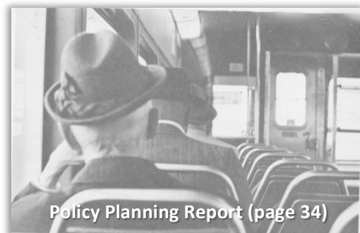
Policy Planning Report (page 34)

Transportation Policies. Cleveland's Policy Planning Report was prepared in an era when the transportation component of most local comprehensive plans focused on identifying high-priority roadway projects for implementation. Not surprisingly, Cleveland's planners took a very different approach. They pointed to the increasing dominance of private automobiles and the resulting decentralization of development (i.e., sprawl)