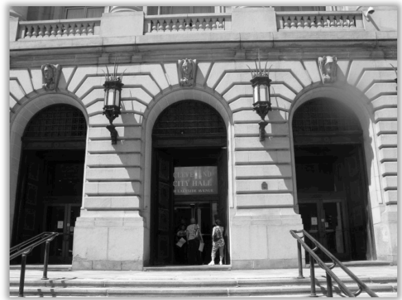
Cleveland City Hall