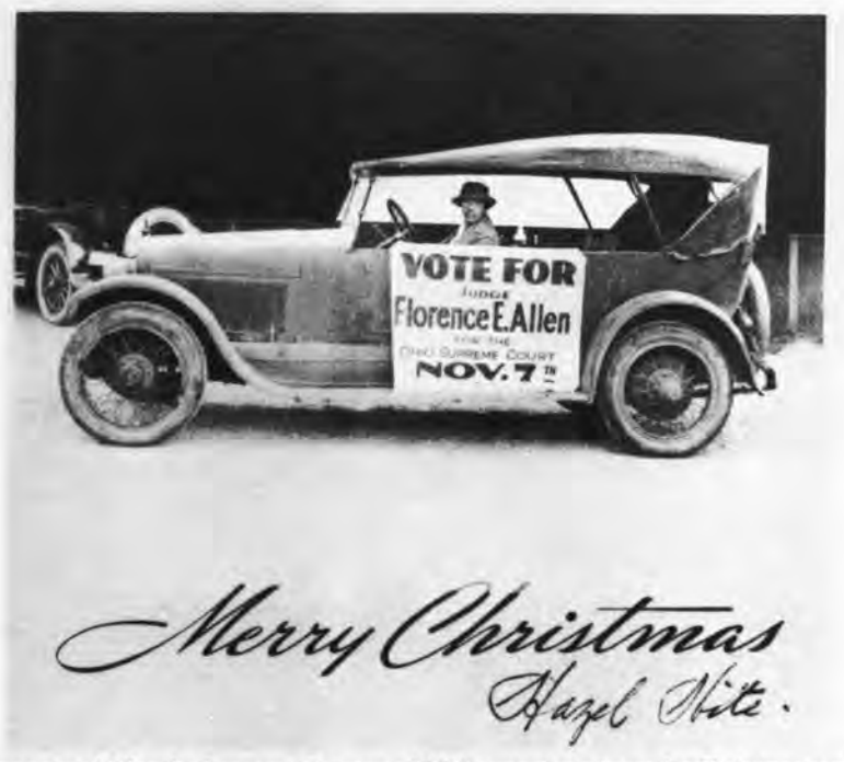
Supporter of Allen for Supreme Court used 1922 campaign picture for Christmas card.

Women were eager to participate because it seemed like the good old days of the suffrage campaign or a fulfillment of what they had hoped for from the suffrage movement. By this time the women's movement was again in great disarray, splintered by factionalism once the vote was achieved, its leadership exhausted or diverted to other causes. In rallying around Florence Allen they could believe that their expectations were being achieved.